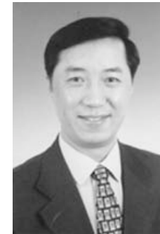
Professor Wu Baiyi, CASS Institute of European Studies

“China and EU should add more substance to their political ties. While overcoming institutional and ethical differences, both need to deepen their mutual confidence by building a multi-tier political dialogue to bridge the gaps not only between top leaders, but also among grassroots level officials, non-government activists and the general public.”